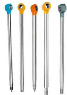
HYDRAULIC PISTON ROD