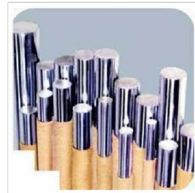
HCP PISTON ROD