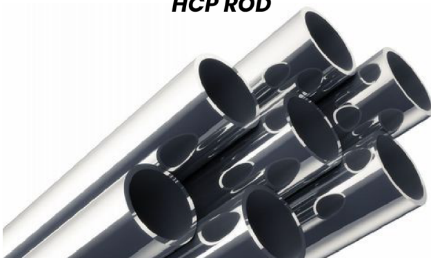
HYDRAULIC PISTON HOLLOW PIPE ROD