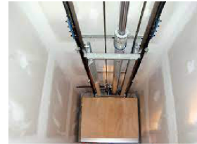
HYDRAULIC ELEVATOR CYLINDER