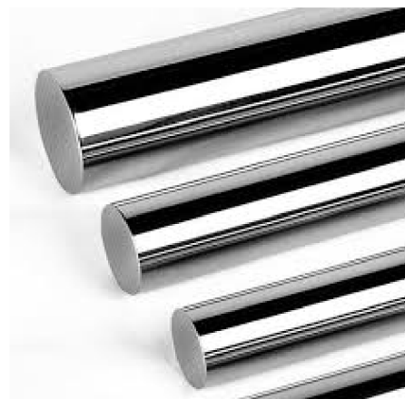
INDUCTION HARDENED PISTON ROD